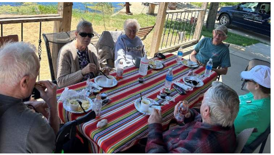
In June we took two day trips to a local pond. Residents enjoyed some great fishing and a picnic lunch. We were thankful to get out and enjoy the beautiful summer days.